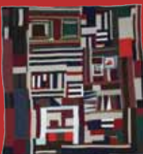
Mary Lee Bendolph, Strips and Strings, 2005